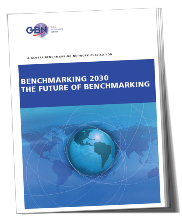
>>Benchmarking 2030 The Future of Benchmarking<<

The GBN embarked on a project to investigate the future of Benchmarking, its development until 2030 and the role of the GBN to strengthen the visibility and implementation of core values in benchmarking. The report comprises a secondary analysis, a survey among Benchmarking Practitioners and GBN Members across the world and international Roundtable discussions involving international Benchmarking Experts.